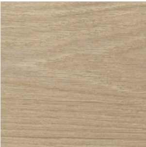
Oak Haya (Porcelain)