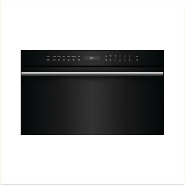
MICROWAVE SPEED OVEN

MICROWAVE SPEED OVEN Wolf, 30" M series contemporary speed oven