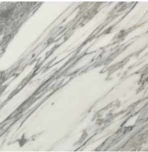
Calacatta Super (Marble)*

SHOWER WALLS, FLOORING & WAINSCOT OPTION: