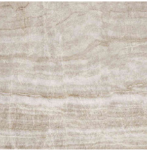
Taj Mahal (Porcelain)