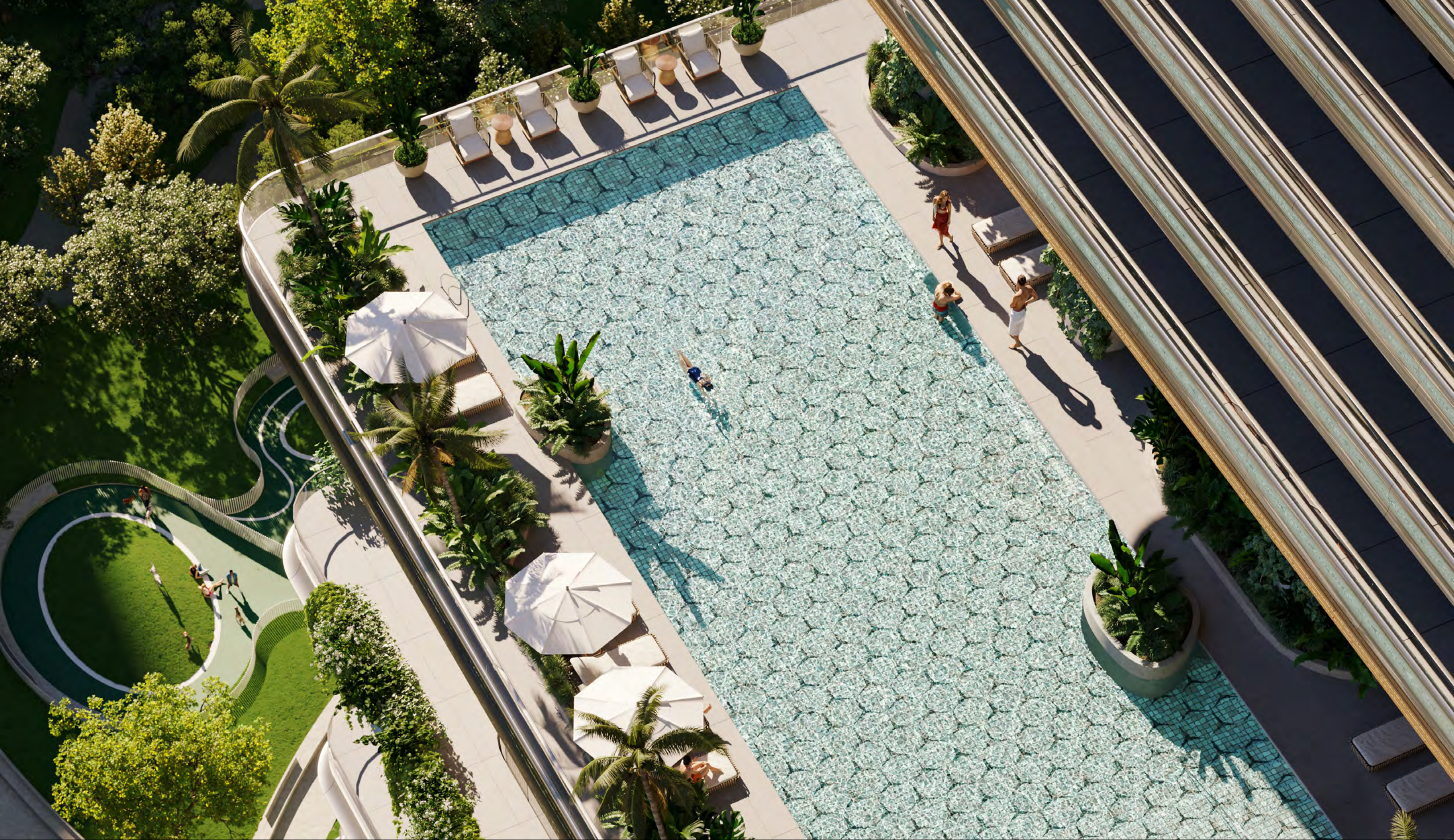
Sun Pool Deck